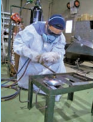
Gas cut & welding