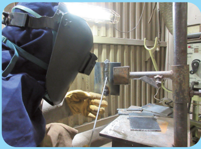
Shielded Metal Arc welding