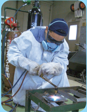
Gas cutting & welding