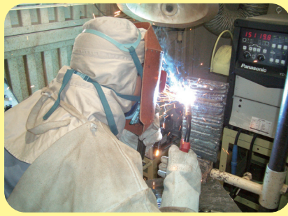
CO 2 -MAG welding